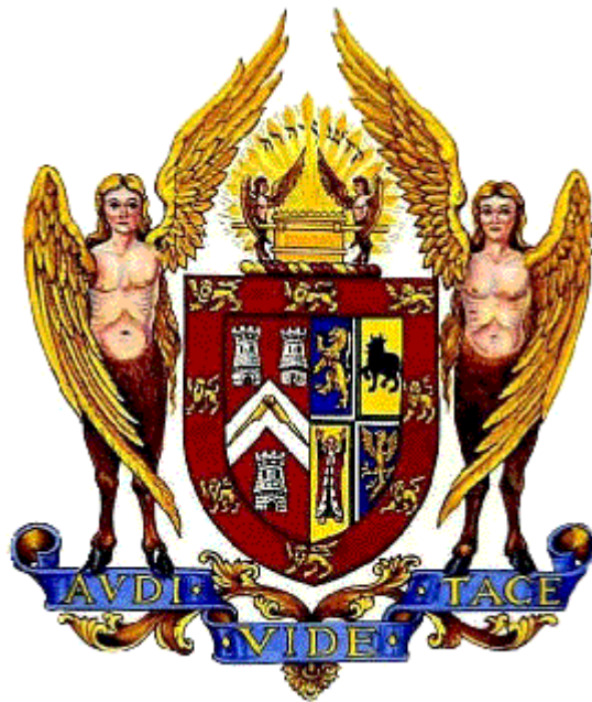
Coat of arms of the United Grand Lodge of England.

I hope you have enjoyed this edition of the bugle, and if you have anything you would like to include or know, please let me know.