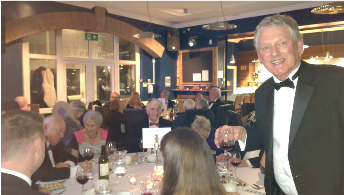
Picture from the 2023 Restaurant 1909 Social Evening