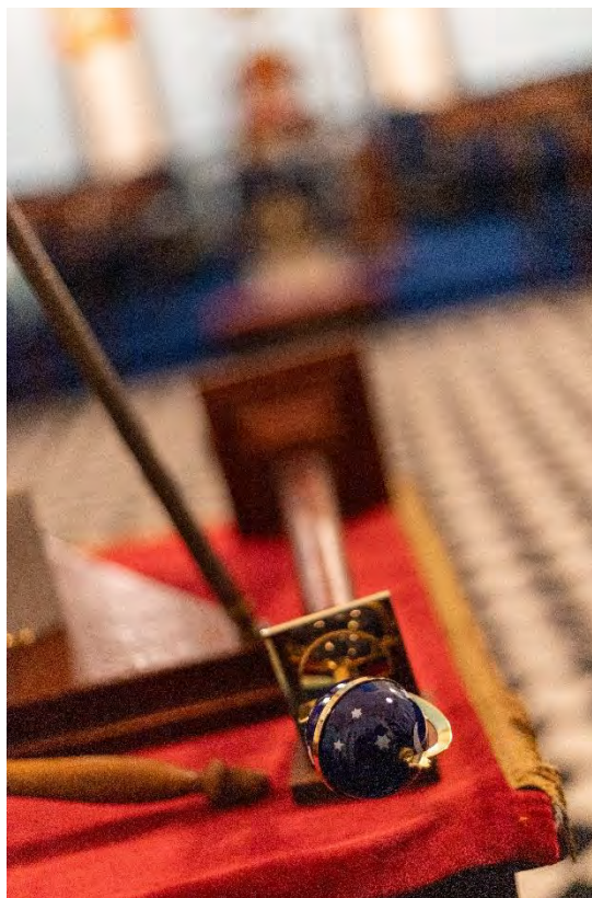
The laid down Junior Warden column, indicating that the lodge is at labour

The staggered steps of 9, 12 & 15 inches are meant to symbolise that each step will carry him further forward than the last, showing his will to go forward and demonstrating his trust and confidence.