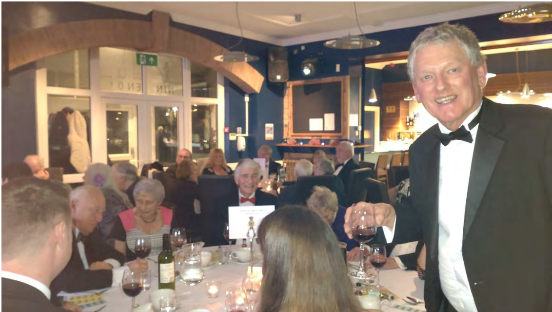
Picture from the 2023 Restaurant 1909 Social Evening