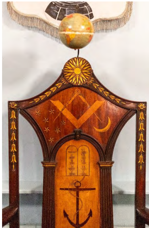
The Worshipful master's Chair.

So, take a look at the honour's board when you are next in the masonic hall and see all those who have been Masters of St Nicholas Lodge before our current Master.