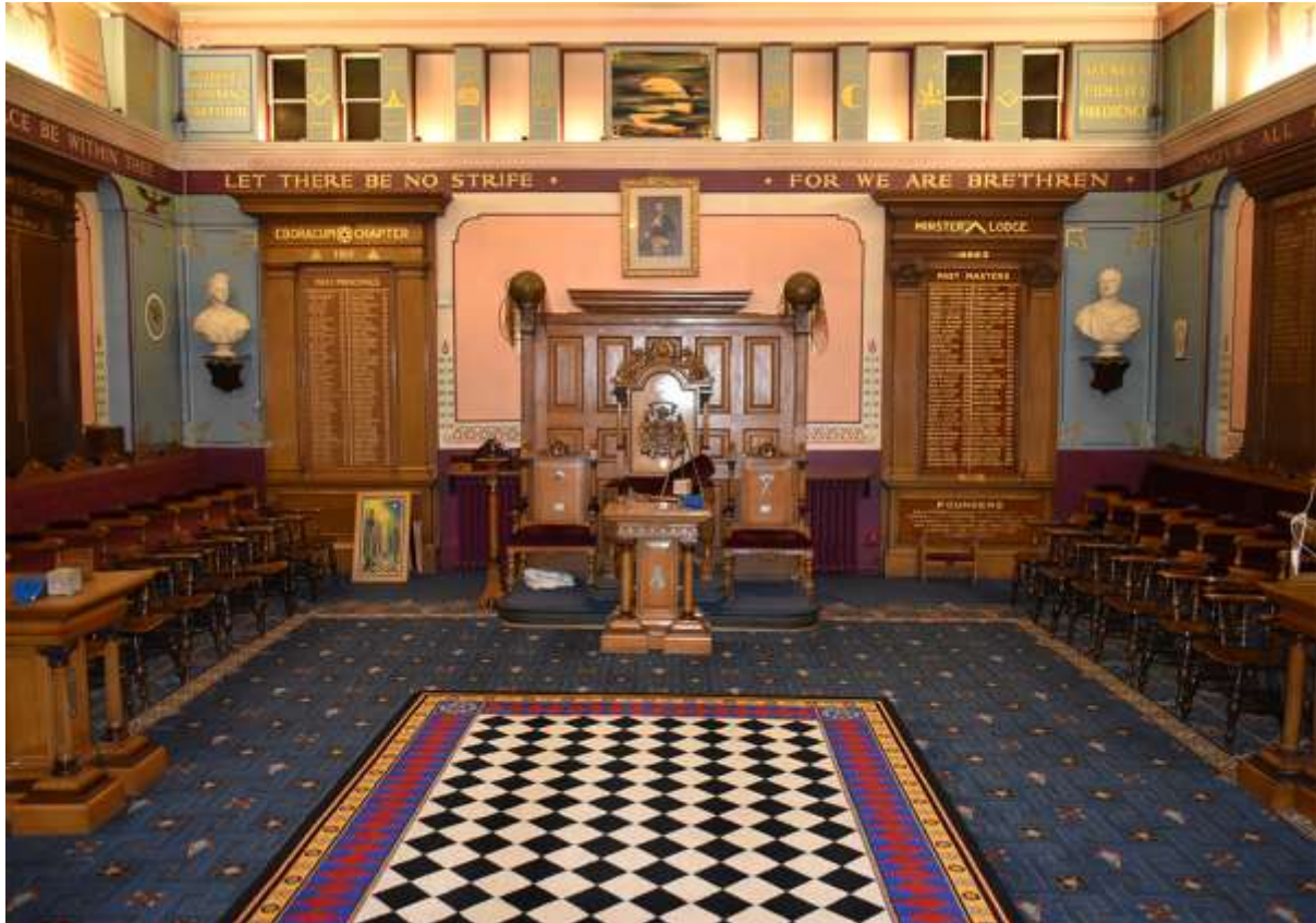
The Interior of St Saviourgate, York

During the dark ages that followed the Roman withdrawal from Britain, and during the time of the Viking invasions was a man called Alcuin. He was a venerated scholar, clergyman, poet and teacher from York who was born in 735 when York was part of Northumbria (north of the Humber). He was also a close friend and counsellor of Charlemagne and travelled around Europe. He is now honoured by the Church of England and venerated a saint by Eastern Orthodox Christians. He is also remembered by the Alcuin Lodge 6300 .