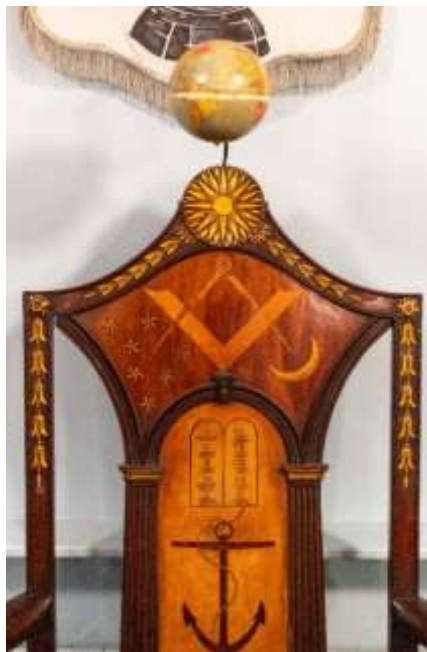
The Worshipful Master's Chair.