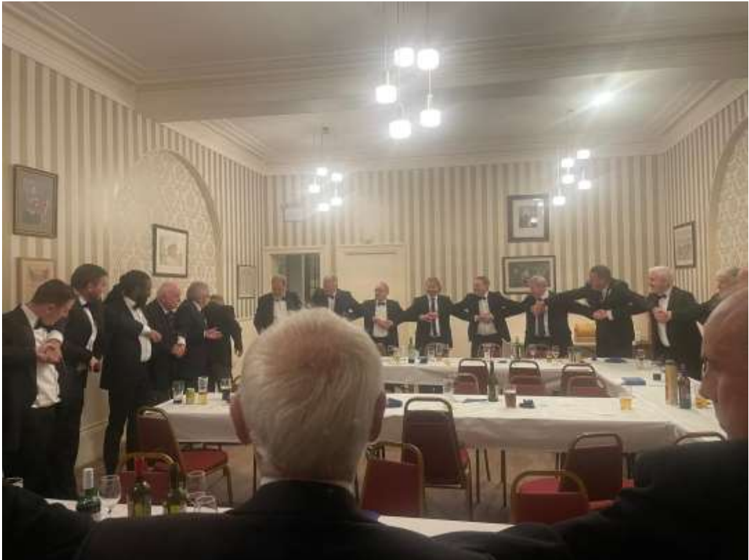
Start of the Adamantine Chain & Entered Apprentice Song