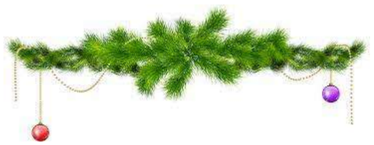
Post Installation Social Afternoon

As is traditional in the St. Nicholas Lodge, the brethren gather in Scarborough the day after installation to enjoy a social afternoon and lunch. Around 12-15 met throughout the afternoon with the hardiest staying on until evening! Here are some highlights from the afternoon: